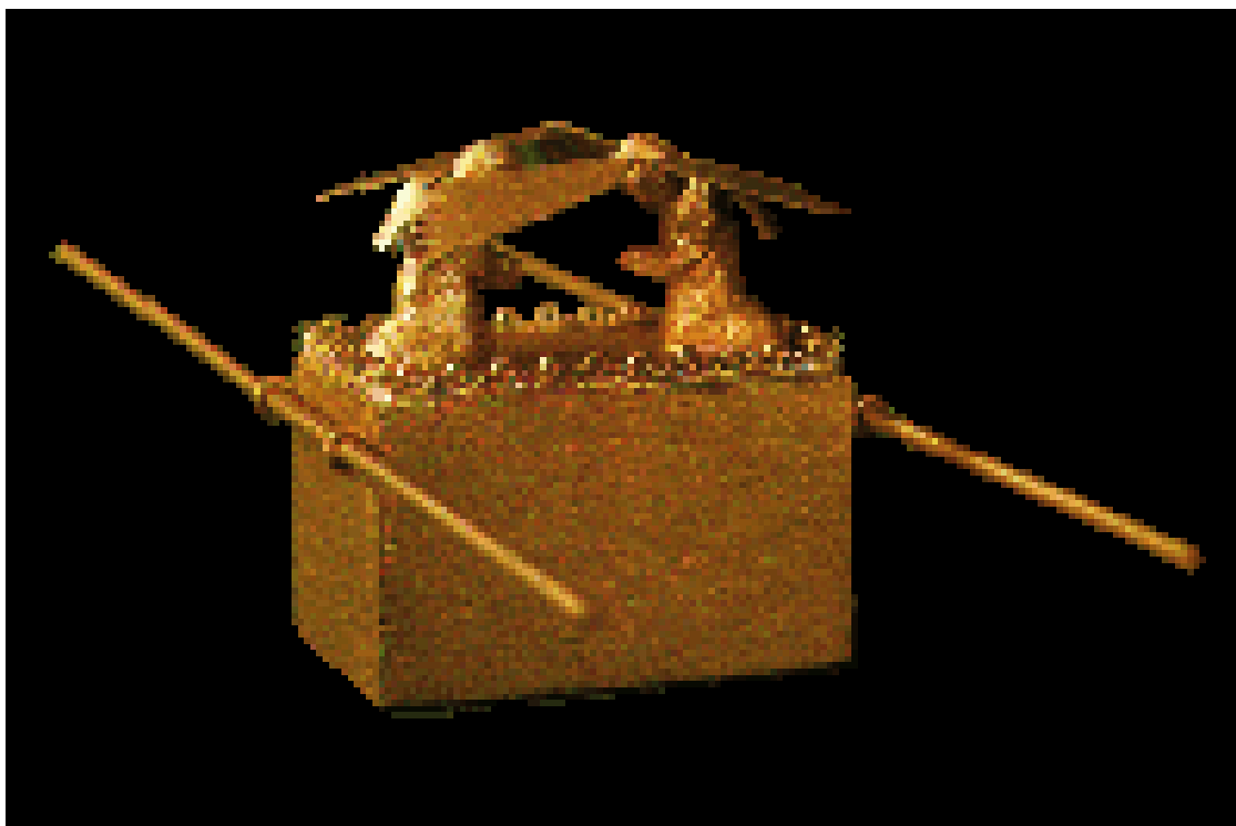
St. Mary Coptic Orthodox Church, East Brunswick, NJ. USA