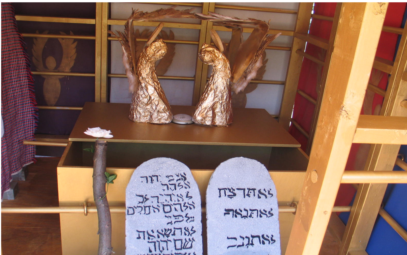
St. Mary Coptic Orthodox Church, East Brunswick, NJ. USA